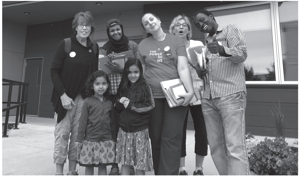
Volunteers registered new voters in the Greater Portland Area in celebration of National Voter Registration Day in September. Want to join future volunteer efforts? Email volunteer@lwvme.org